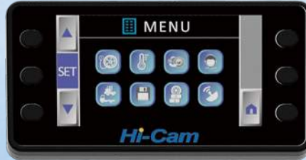
4.3" Color LCD