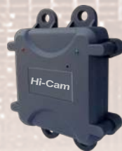
HR-01B 訊號傳輸轉接器 HR-01 B Repeater