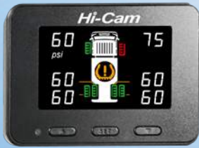
2.8" Color LCD

Tire Pressure Monitoring System for Truck/Bus