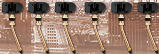
TPMS發射器 TPMS Sensor